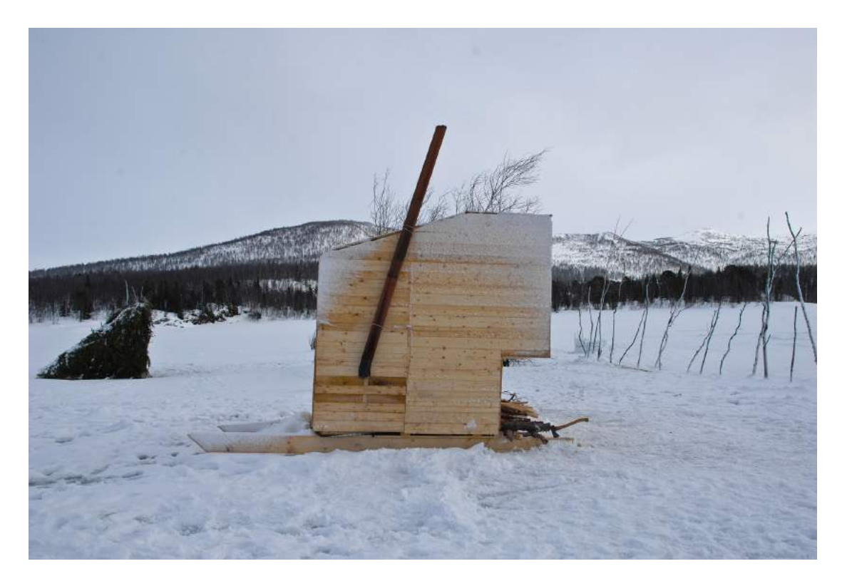
Nomad Sauna, 2012, Mo i Rana, Norway (Marco Casagrande with architecture students)