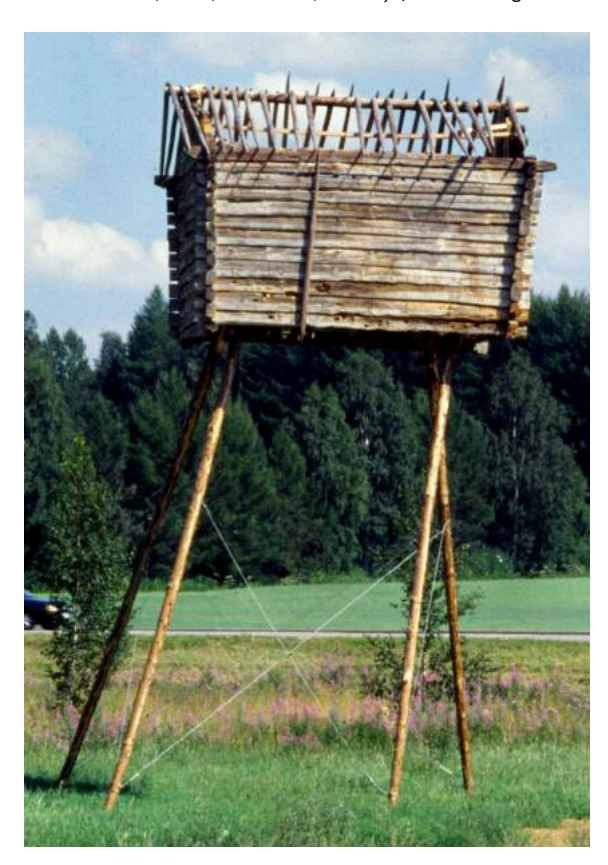
Land(e)scape, 1999, Savonlinna, Finland (Marco Casagrande and Sami Rintala)