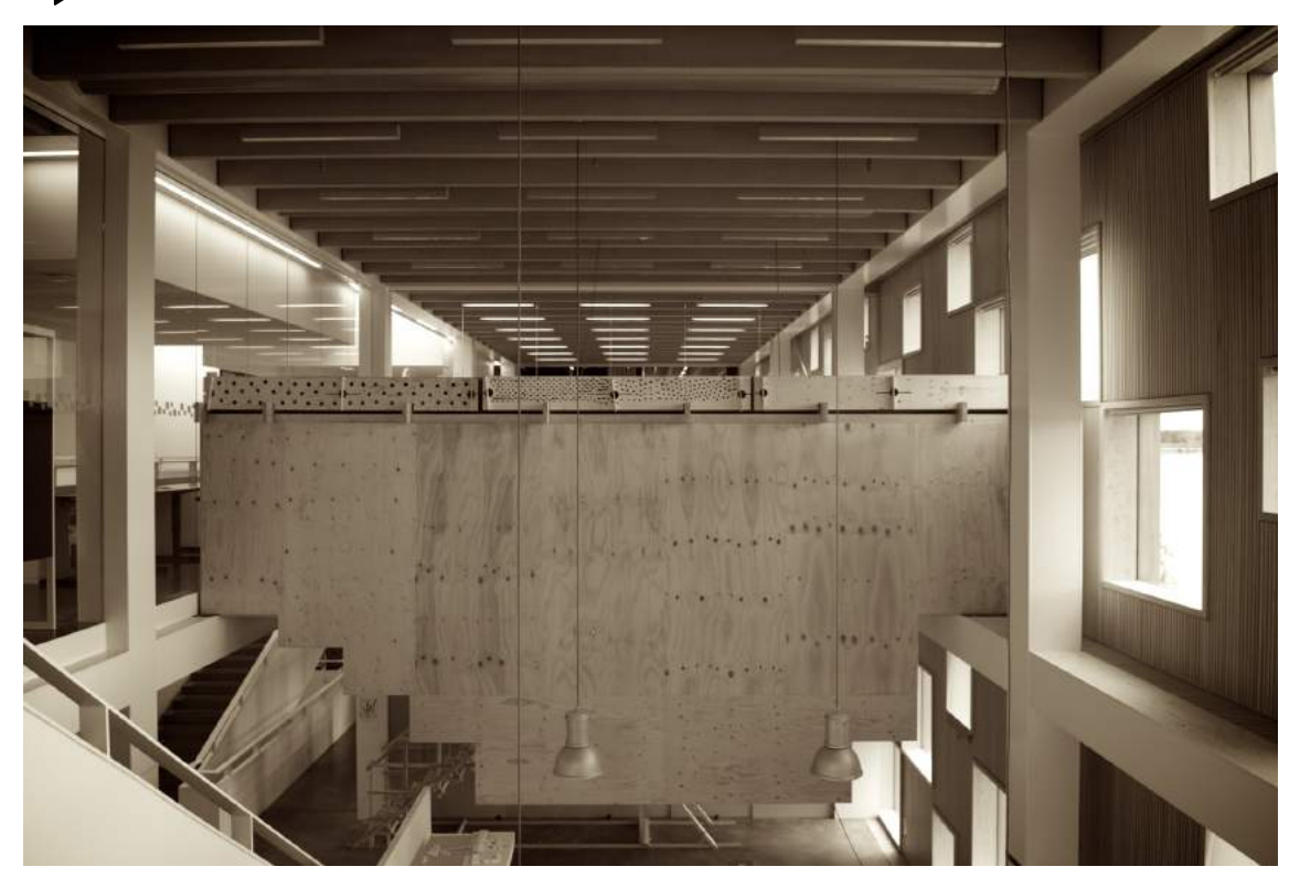
Silent Room, 2013, Umeå, Sweden (Alberto Altés with architecture students)