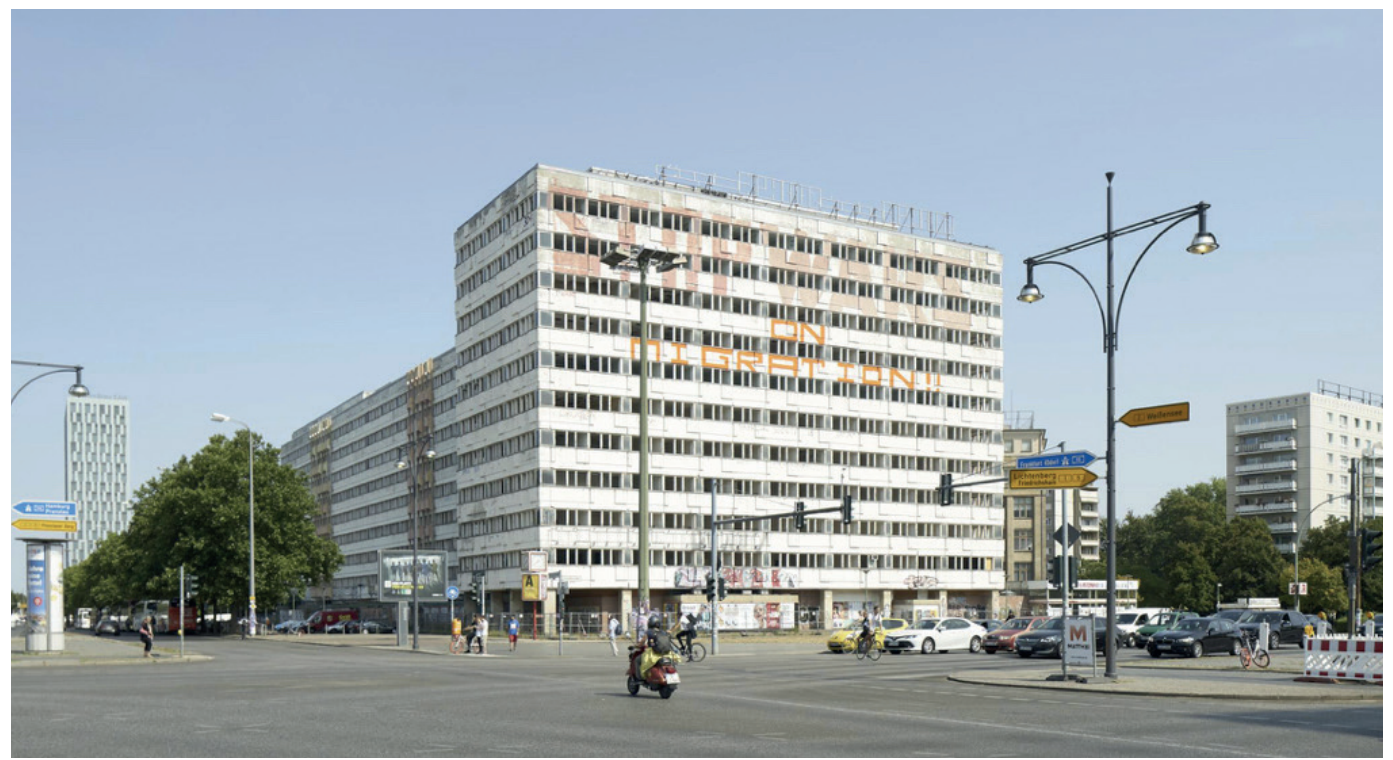
Haus der Statistik, south facade