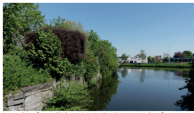
house of time Brugge 2019, raumlaborberlin with youngsters from Brugge