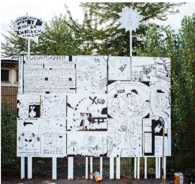
billboard to promote the artists house on its future site in Köln-Kalk, 2020