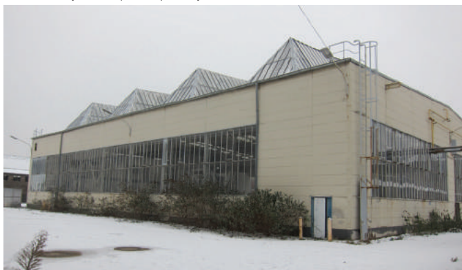
KHD inspection hall is one of the possible sites for the artists house