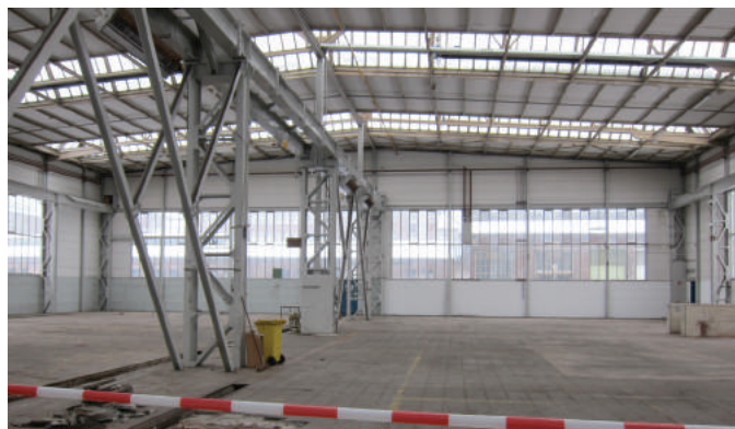
KHD inspection hall inside