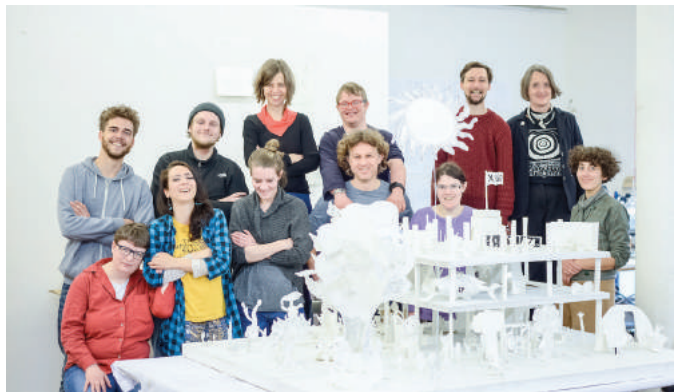
Team of KAT 18 artists at first workshop with raumlabor 2017