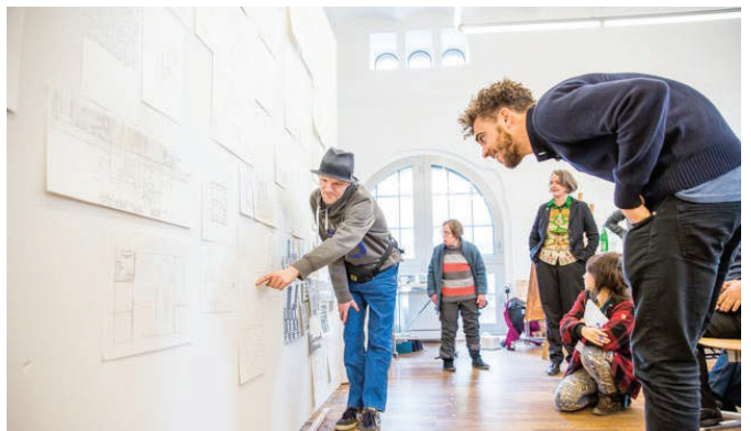
Presentation of individual thoughts on studio conditions for future artist