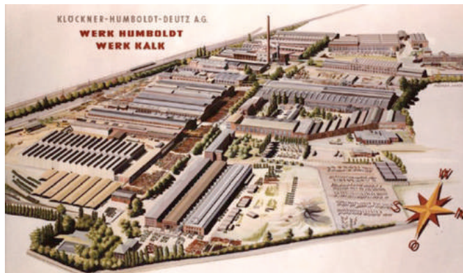
Werksgebiet Klöckner-Humboldt-Deutz AG. Werk Humboldt / Werk Kalk. Illustration, 1960.