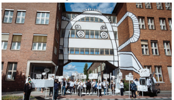
protest march for KUNSTHAUS KALK inf ront of the elephant gate, 2020