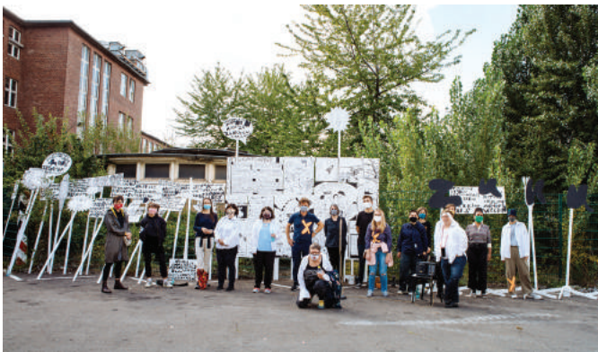
performative protest to claim the site for the Artists house / Köln Kalk 2020