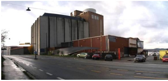
The Bas building

The heart of the school is the large hall, where students can build in full scale and experiment with different materials and techniques. The administration and the library are situated close to the hall.