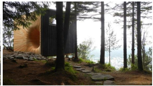
Mountain Hut "Tubakuba", Bergen