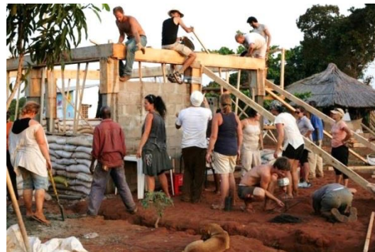
Master class studio in Mozambique, "design and build"