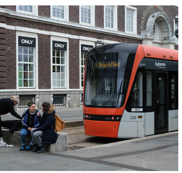
Platform for conversations and rearrangments