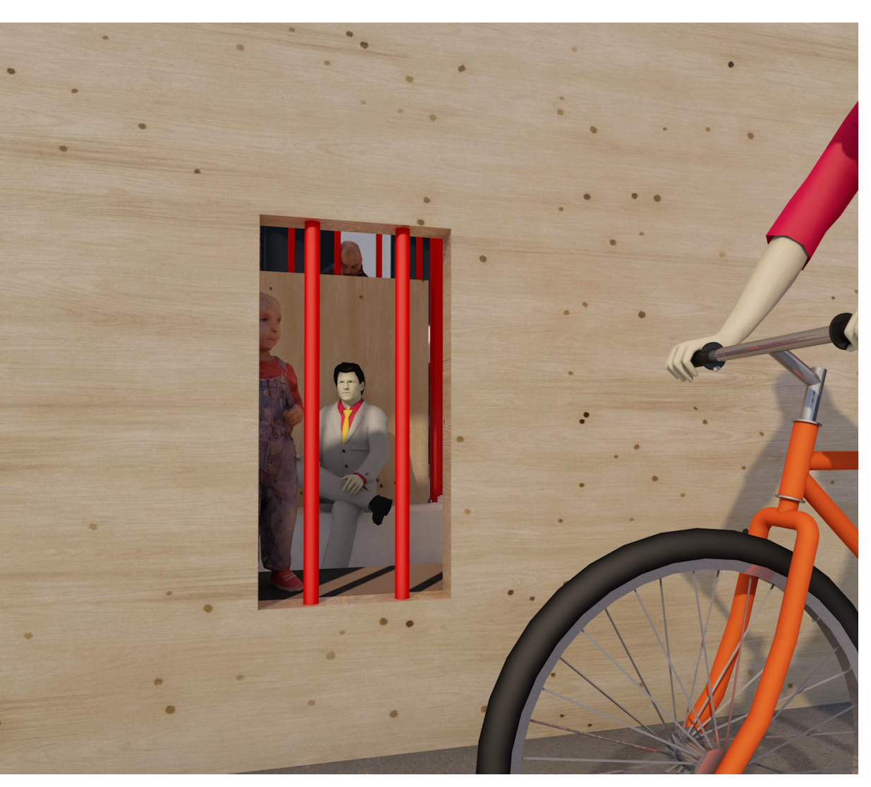
dreams, and postures

Waiting, pausing and appearances become overarching tematics, and acts as objects of study. The way these thematics come to expression is understood as constructions- elements for emerging architectures.