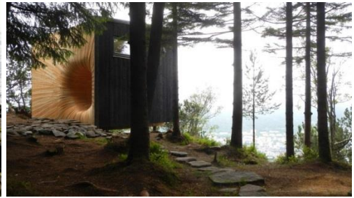
Mountain Hut "Tubakuba", Bergen