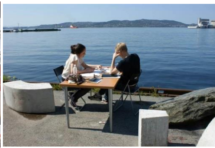
From the quayside