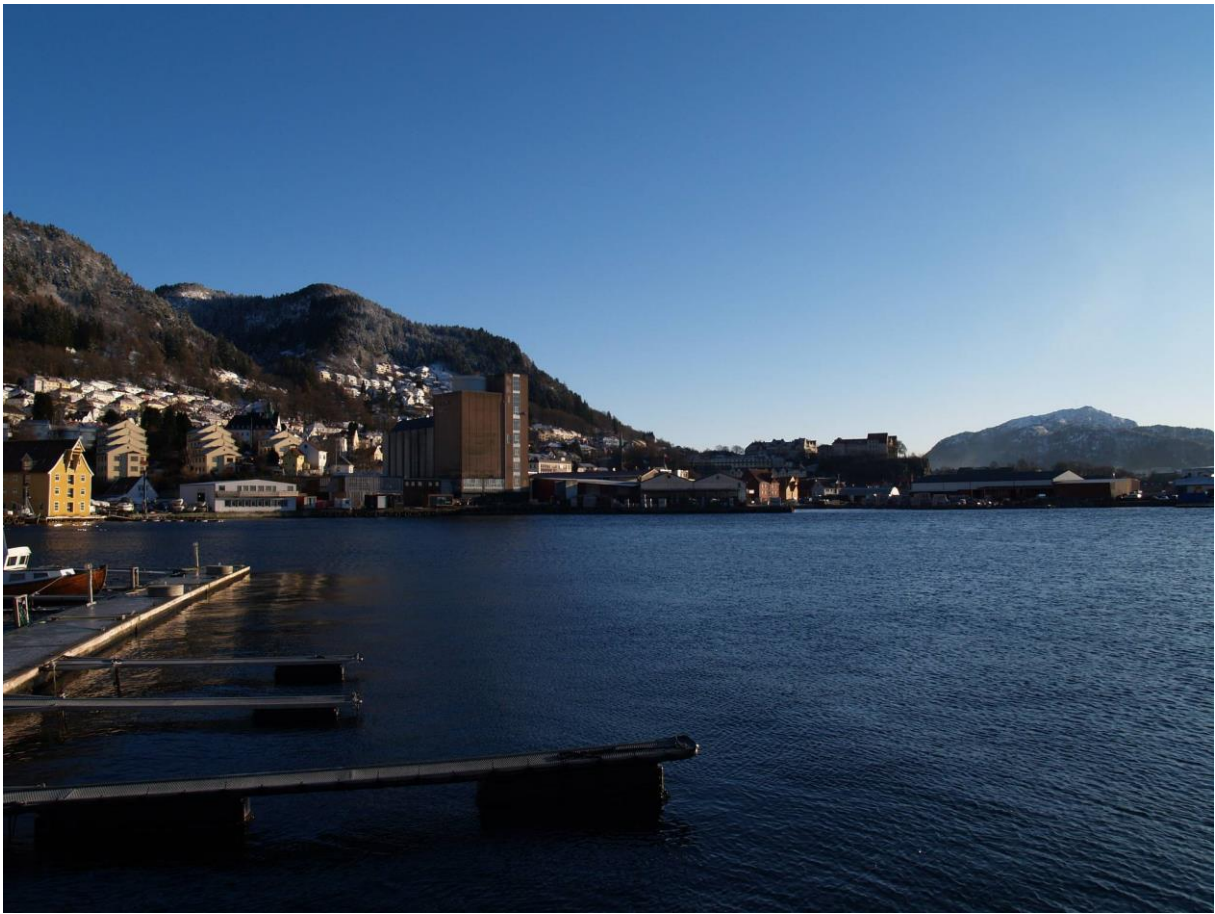
The BAS-building is situated in Sandviken, just 15-20 minutes walk from town centre