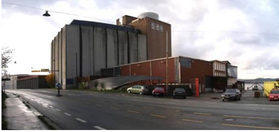
The Bas building

The heart of the school is the large hall, where students can build in full scale and experiment with different materials and techniques. The administration and the library are situated close to the hall.