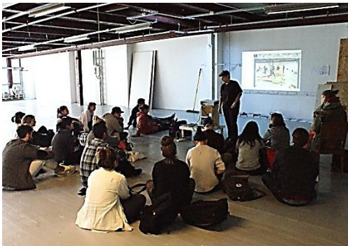
Reviews at BAS