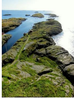
Solund, west coast Norway