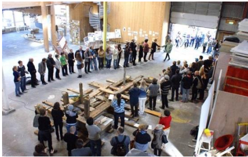
Welcoming of new students

The teaching will be in English, so it is not required to speak and understand Norwegian in order to study at BAS. We do NOT ask for a language certificate for exchange student, but trust that the sending institution advice and choose students that can manage with English as main language.