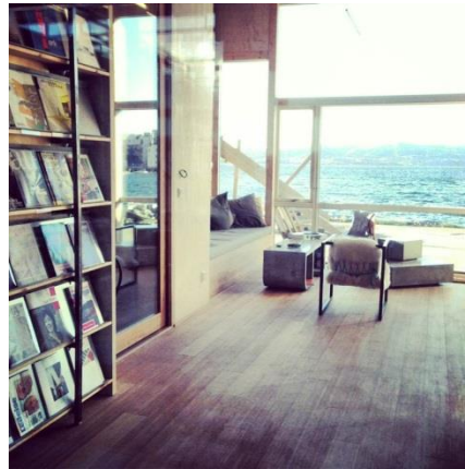
From the Library