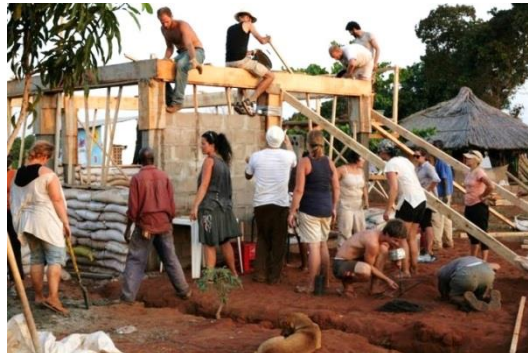
Master class studio in Mozambique, "design and build"