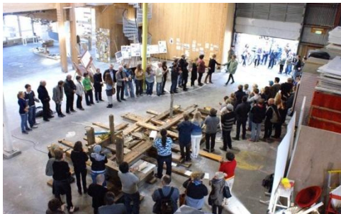
Welcoming of new students

The teaching will be in English, so it is not required to speak and understand Norwegian in order to study at BAS. We do NOT ask for a language certificate for exchange student, but trust that the sending institution advice and choose students that can manage with English as main language.