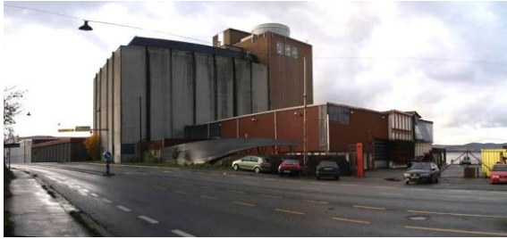
The Bas building

The heart of the school is the large hall, where students can build in full scale and experiment with different materials and techniques. The administration and the library are situated close to the hall.