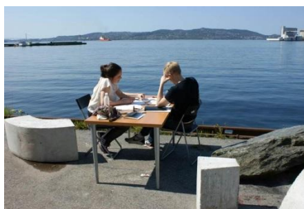
From the quayside

Exchange students are automatically members of the Students Welfare Organisation in Bergen, which offers a lot of welfare services. Have a look at www.sammen.no